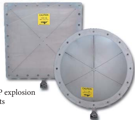
EXP explosion vents