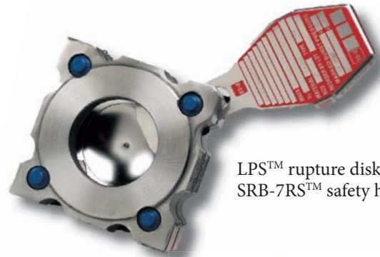
LPS™ rupture disk and SRB-7RS™ safety head